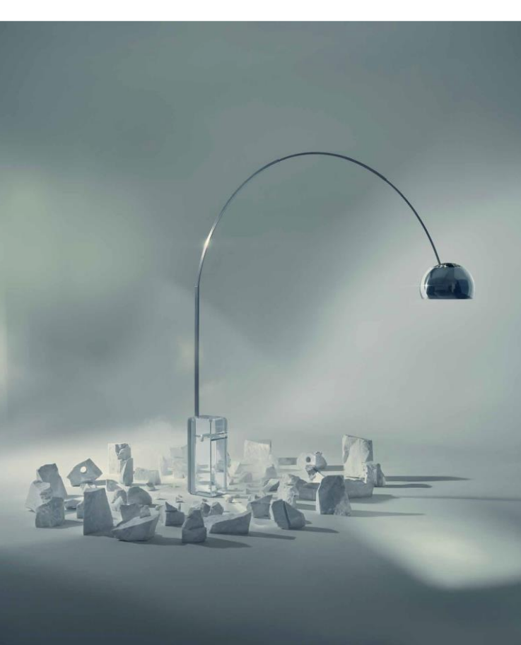
Arco K, designed by Achille & Giacomo Castiglioni

FLOS hub at Fabbrica Orobia during the Milan Design Week